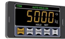
Smart phone application (Bluetooth Option)