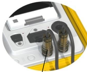
Push-pull Quick Connector