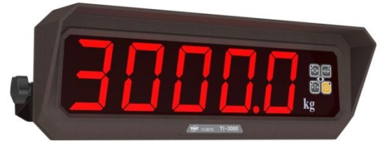
TD-2300F / TD-3000F(Optional)